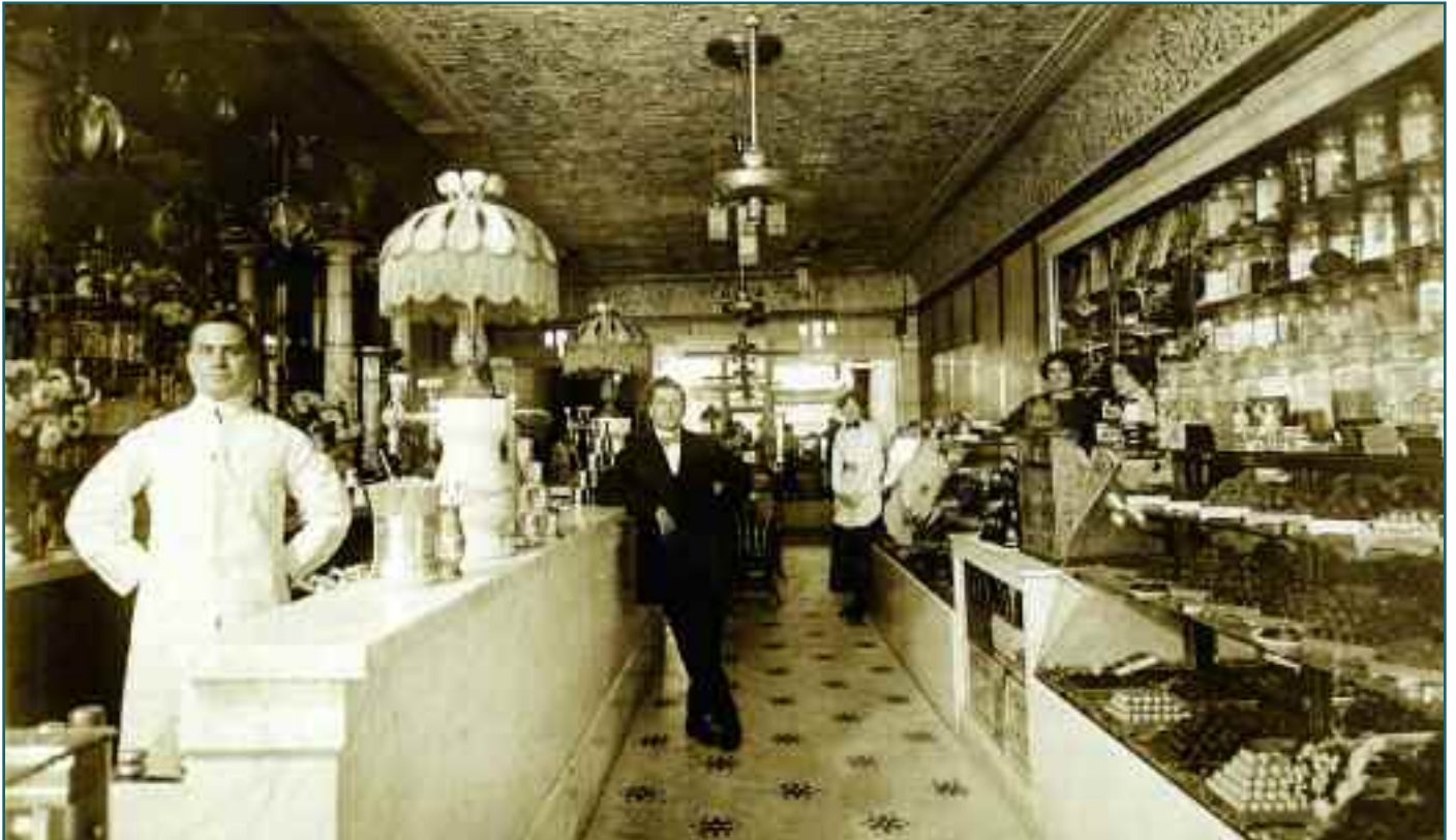
June McCluskey donated this wonderful photograph showing Kleinau's confectionary shop, taken in October 1912. William F. Kleinau operated this candy store, located at 218 N. Center Street, from the late 1880s until the about 1930.