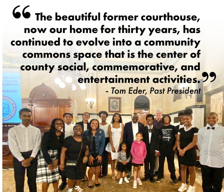
Members of the NAACP Youth Council pose with Bloomington & Normal's mayors c. 2023

Intergenerational learning is paramount to the mission of the Youth Council. The student-led group produced a mini-documentary and screened it for an audience at the Museum. The documentary featured long-time educators Dr. Charles and